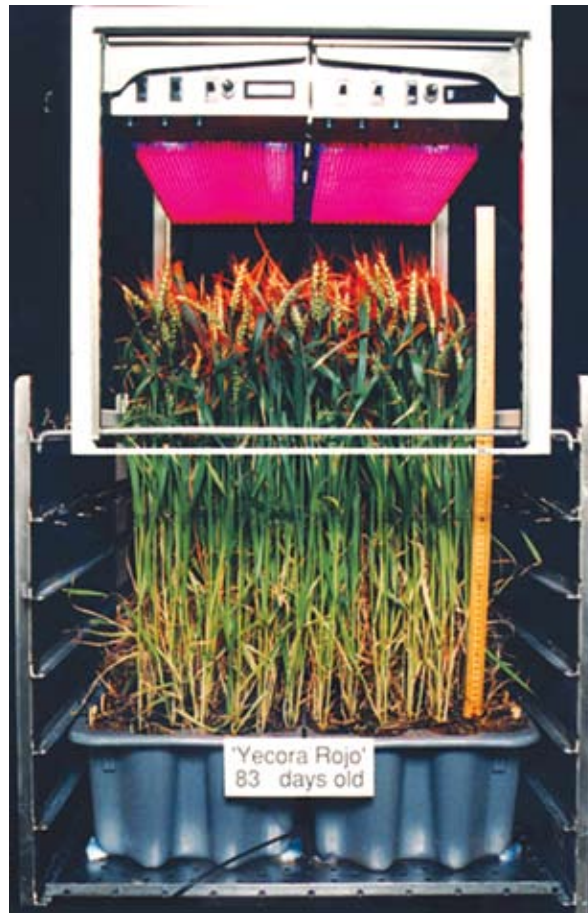
Studies have shown red LEDs are a viable light source for growing plants in space flight due to their small mass and volume, wavelength specificity, longevity, and safe operation.

QDI then used a Defense Advanced Research Projects Agency (DARPA) SBIR contract to develop the WARP 10 (Warfighter Accelerated Recovery by Photobiomodulation) unit as a full realization of its PBMT research. WARP 10, a hand-held, portable, HEALS technology originally intended for military first aid applications, received U.S. Food and Drug Administration (FDA) clearance in 2003, and a consumer version was introduced for temporary relief of minor muscle and joint pain. WARP 10 has been found to relieve arthritis, muscle spasms, and stiffness; promote relaxation of tissue; and temporarily increase local blood circulation.