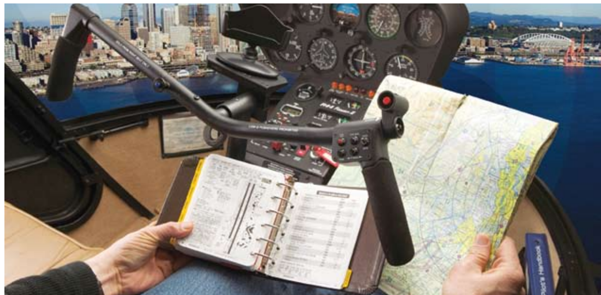
HeliSAS provides unmatched stability and ease of handling, including “hands near” operation while maintaining heading or navigation course and attitude—even during turbulent conditions.

HeliSAS™ is a trademark of Hoh Aeronautics Inc.