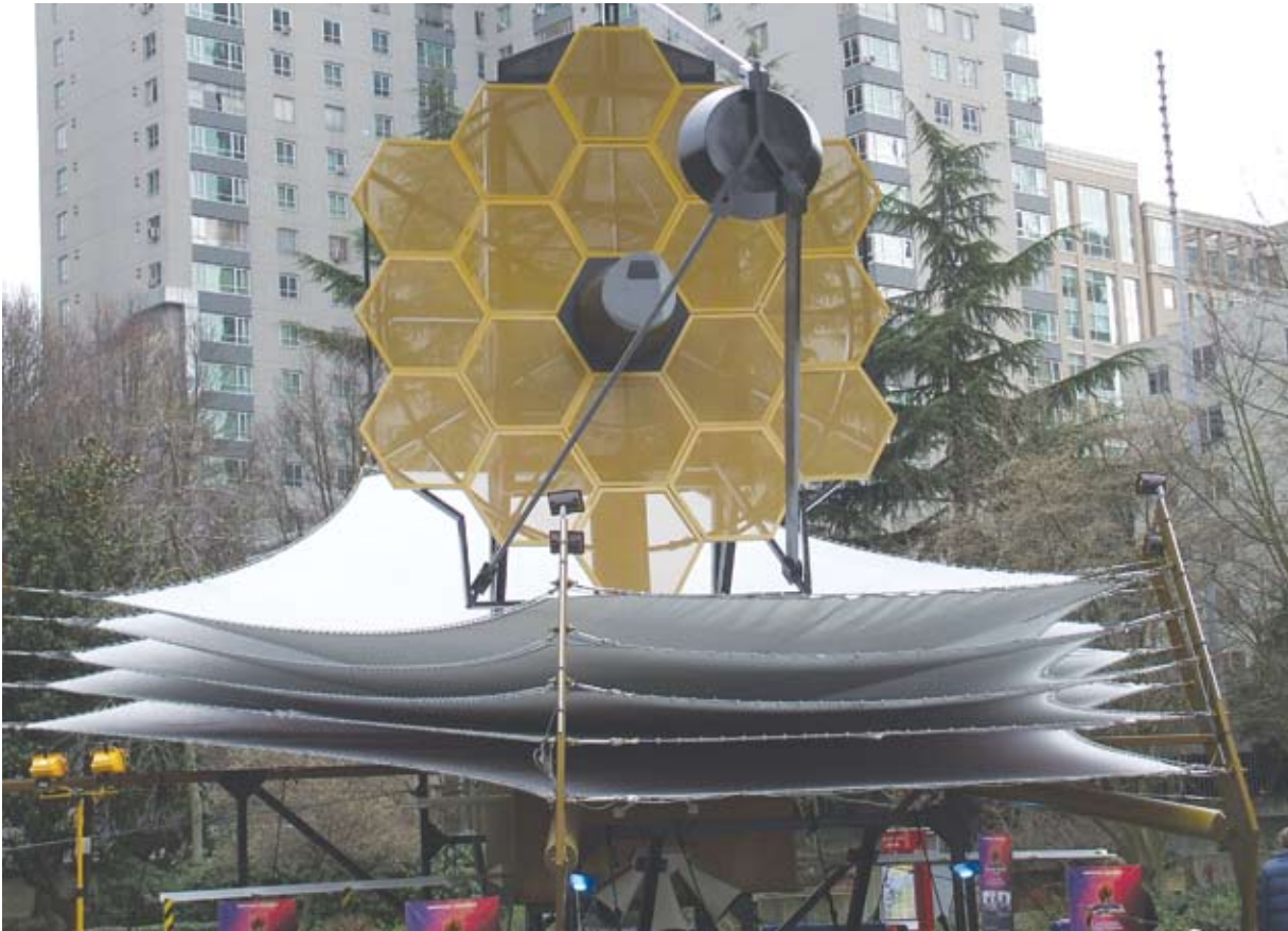
After adopting SpaceWire in 2000, NASA scientists and developers improved the network version of SpaceWire for the James Webb Space Telescope (shown here as a scale model).

board. BAE Systems sought consultation from Goddard innovators to build a new ASIC incorporating the new SpaceWire implementation.